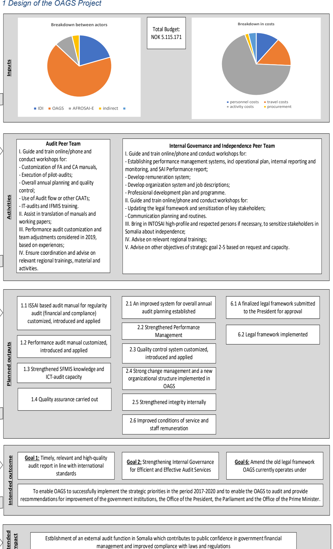
Figure 1 Design of the OAGS Project